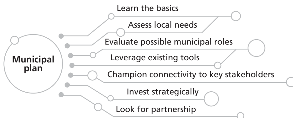
Figure 1: Components of a Municipal Roadmap (ROMA, 2020)

The Roadmap is not a linear pathway toward connectivity, but rather a set of components that councils can consider as it determines what is most helpful for their community (see Figure 1). It is not linear because some components will take longer than others, while others may need to be repeated based on changing local circumstances. Timing is another layer. While some components should start in the short-term, it does not suggest that all others should happen in sequence.